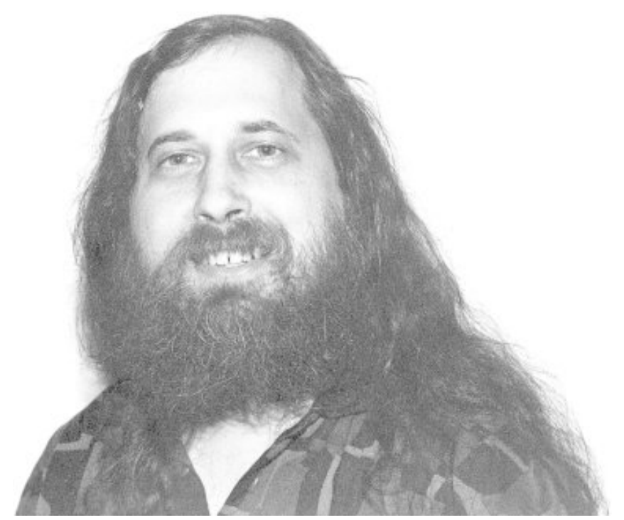
Richard Stallman, circa 2000. "I decided I would develop a free software operating system or die trying.. of old age of course."

Agitated, Stallman leaves his post at the front of the room and takes a seat in a front-row chair, tapping a few commands into an already-opened laptop. For the next 10 minutes Stallman is oblivious to the growing number of students, professors, and fans circulating in front of him at the foot of the auditorium stage.