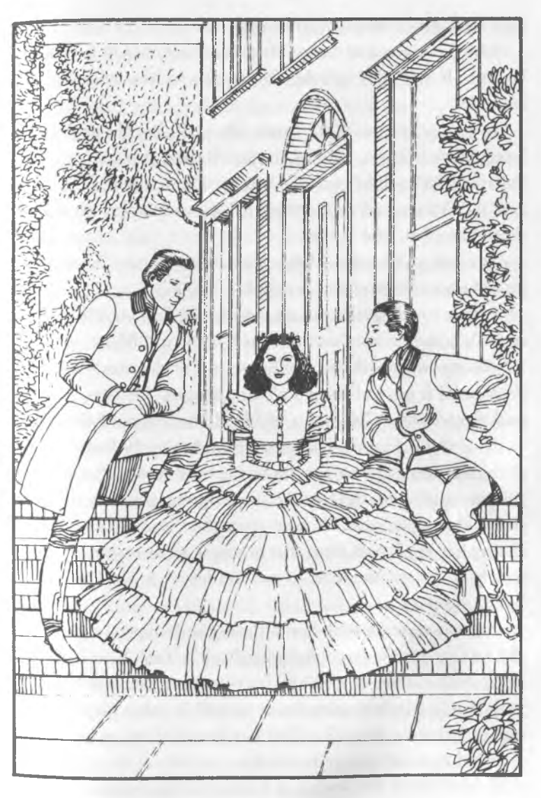
The twins waited for Scarlett to invite them to supper; and it was some time before they realized she was not listening to them.