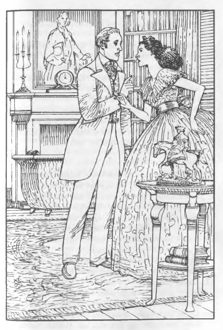
'But I love you,' she cried, 'and I know you love me. Ashley, you do care, don't you?'