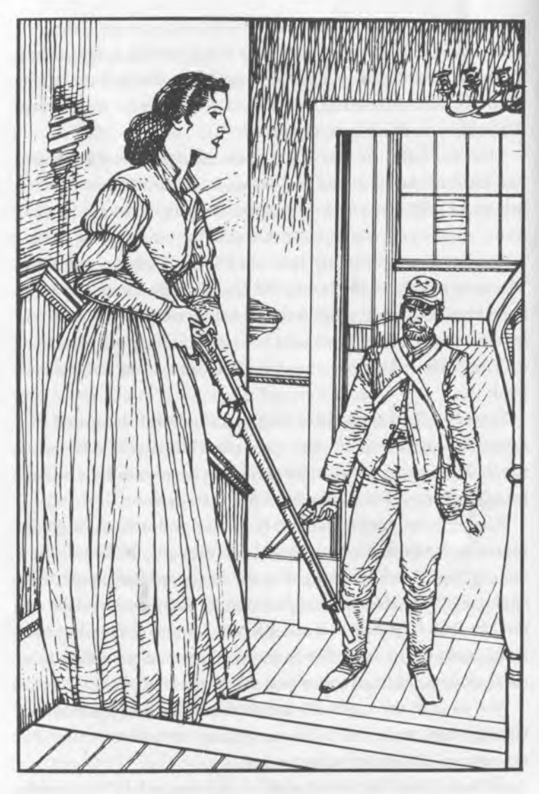
He was standing in the doorway of the dining-room, his gun in one hand. 'So there is somebody home,' he said.