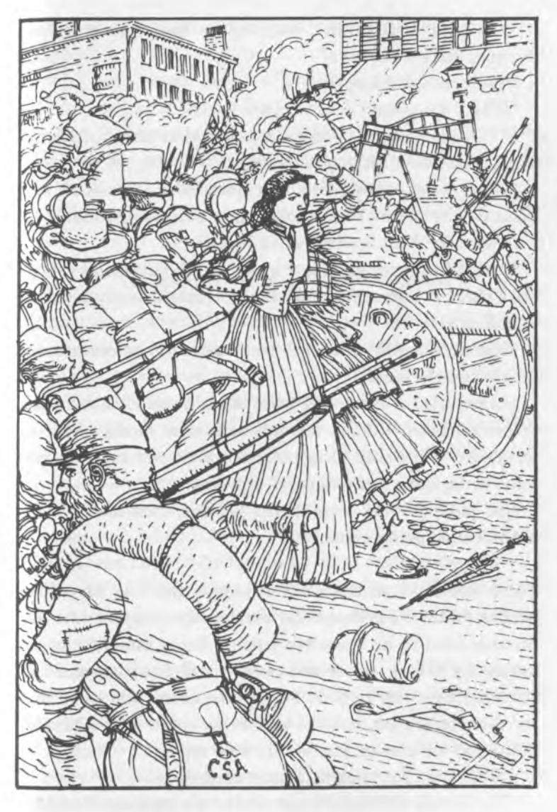
On the streets beyond the Atlanta Hotel, soldiers were moving out of the city.