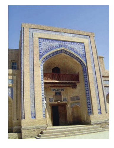
Fig. 5.4 Inside views of a madrassa-turned-restaurant in Khiva, Uzbekistan, 2001. By Bret Wallach. Source: http://www.greatmirror.com/index.cfm?countryid=843&chapterid=883&picturesize=medium