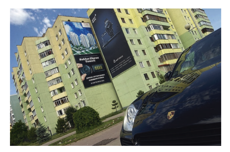
Fig. 5.5 A photo showing a view of a residential area in the city of Almaty, Kazakhstan, in 2006: a luxury Porsche sports car appears near some typical Sovietera nine-floor apartment complexes, on the side of which hang two huge commercial posters advertising new upscale apartments and luxury Swiss watches for sale.

One of the major themes in commercial advertisements in both post-Soviet Uzbekistan and Kazakhstan is hedonism, which promotes the belief that personal satisfaction and pleasure is ultimately found in material consumption and possession. Figure 5.5 shows a view of a residential area in the city of Almaty, Kazakhstan, in 2006. In the picture, a luxury Porsche sports car appears near some typical Soviet-era nine-floor apartment complexes, on the side of which hang two huge commercial posters advertising new upscale apartments and luxury Swiss watches for sale. These objects and images of objects of conspicuous consumption silently attest to the permeation of consumer culture, particularly hedonistic consumption values that have entered this country along with its capitalist transformation. This is in stark contrast to Soviet life in the past, when housing was provided by the government free of charge for all Soviet citizens. Mass housing construction was a part of the Soviet development project to build a prosperous society in line with communist ideals. Goods were produced for meeting the needs of people, not for profits. However,